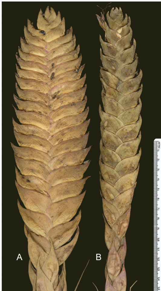
Fig. 3. Dried spikes. A. Tillandsia jalisco monticola Matuda ( J. Ceja et al. 1473 (UAMIZ)); B. Tillandsia magnispica Espejo & López-Ferrari ( A. Espejo et al. 6312 (UAMIZ)).

Paratypes: Mexico, Oaxaca, distrito de Pochutla, municipio de San Pedro Pochutla, N of Pochutla, 1981, C. S. Gardner 1445 (SEL, US, line drawing by Gardner, 1982); distrito de Pochutla, municipio de San Pedro el Alto, 18 km al S de San Miguel Suchistepec, sobre la carretera a Pochutla, 1700 m s.n.m. Bosque de Pinus