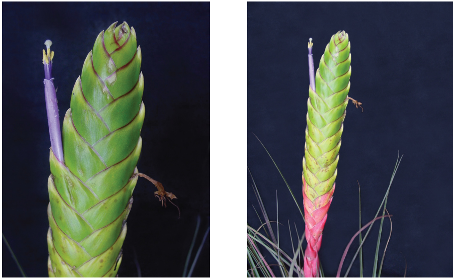
Fig. 1. Tillandsia magnispica Espejo & López-Ferrari ( A. Espejo et al. 6312).