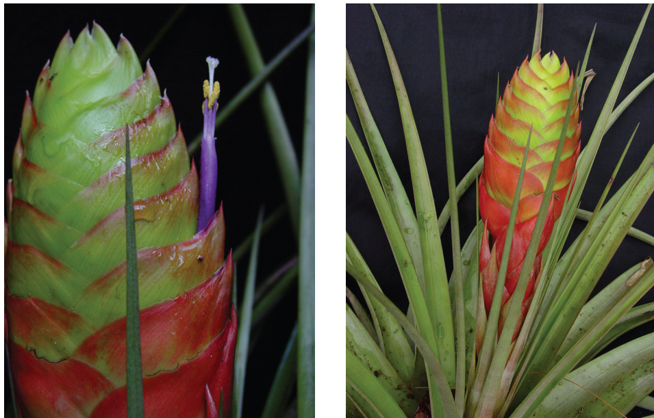
Fig. 2. Tillandsia jaliscomonticola Matuda ( J. Ceja et al. 1473).