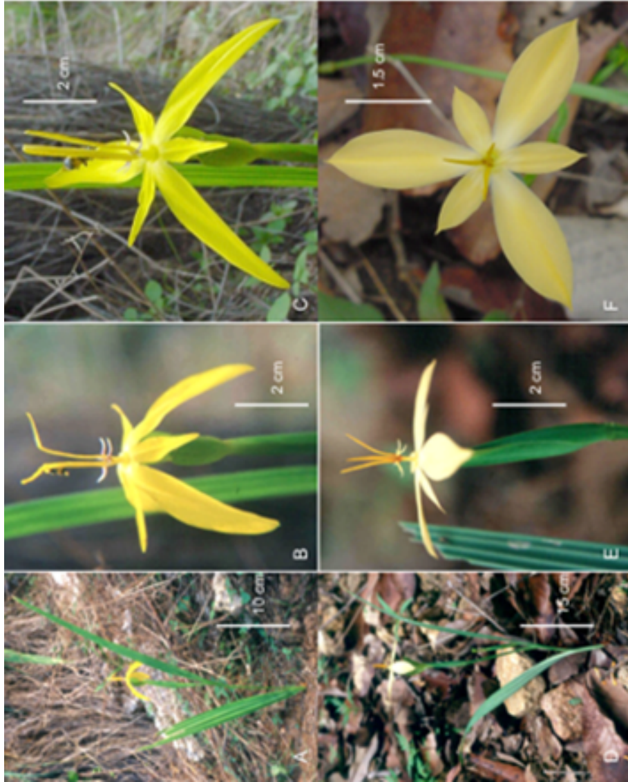
Fig. 1. A-C Colima tuitensis . A. habit; B. flower, lateral view; C. flower, frontal view; D-F Colima Colima . D. habit; E. flower, lateral view; F. flower, frontal view.