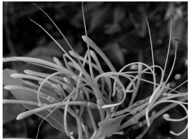
Figure 1. Typical inflorescence of Psittacanthus schiedeanus showing open flowers and floral buds at various developmental stages. Note that the petals strongly curl around and the filament holding out the anthers in all directions inserted low on the petals.

Study system. Psittacanthus schiedeanus (Schlecht. & Cham.) G.Don, parrot-flower mistletoe, is a shrubby (up to 3 m in height) hemiparasite distributed along the eastern rim of the Sierra Madre Oriental between 1000 to 1800 m above sea level in Mexico to Panama. It parasitizes tall trees in evergreen montane forests (Burger and Kuijt, 1983; Cházaro and Oliva, 1988; López de Buen et al. , 2002; Kuijt, 2009). Throughout its geographic range, it parasitizes branches of more than 20 native and introduced host tree species (Cházaro and Oliva, 1988; López de Buen and Ornelas, 1999). In central Veracruz, the most severe infections occur on Liquidambar styraciflua var. mexicana (Osted.) (=macrophylla) (Altingiaceae) (López de Buen and Ornelas, 1999; López de Buen et al. , 2002). Reproductive plants with terminal and secondary inflorescences can produce several hundred flower buds that differentiate and develop during June and July. The floral buds (7.5–8.5 cm long) are more or less straight, slender, slightly widening below tip. Long-pedicelate (10–30 mm long, n = 360 , J.F. Ornelas, unpublished data) flowers are arranged in 3.5 pairs of triads with